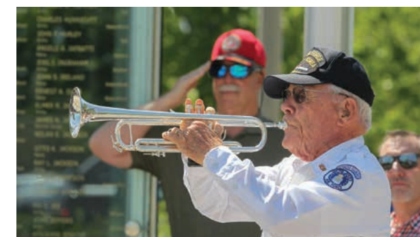
Kern Veterans Memorial Foundation