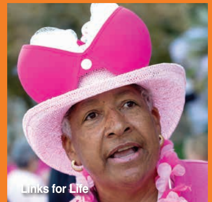
Links for Life