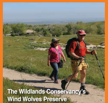
The Wildlands Conservancy's Wind Wolves Preserve