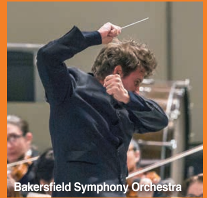
Bakersfield Symphony Orchestra