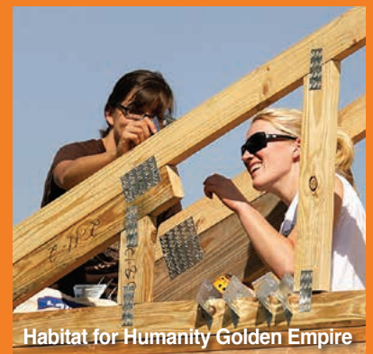
Habitat for Humanity Golden Empire