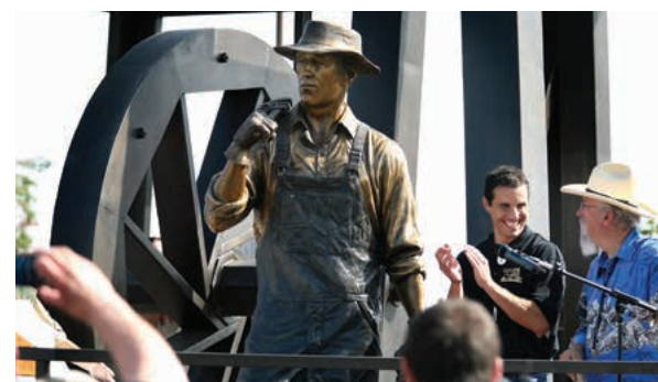
Taft College Foundation: Oilworker Monument