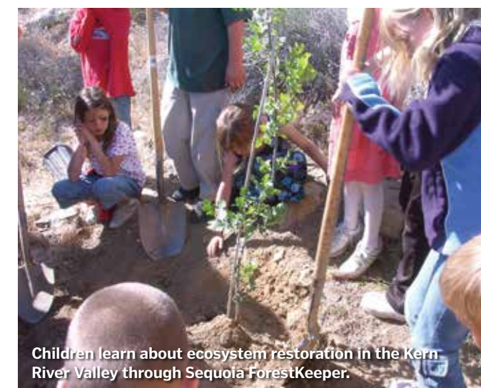
Children learn about ecosystem restoration in the Kern River Valley through Sequoia ForestKeeper.