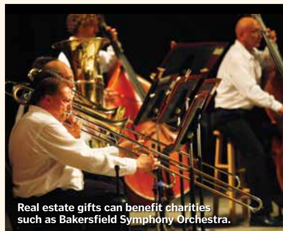
Real estate gifts can benefit charities such as Bakersfield Symphony Orchestra.